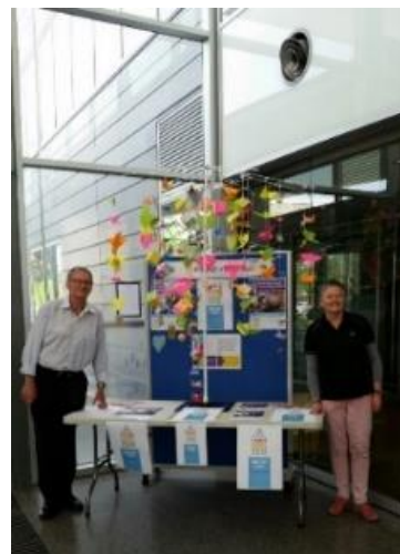
Victor Harbor: Art installation what was exhibited in the Victor Harbor Council foyer