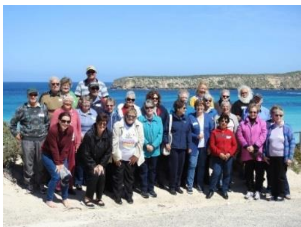
Eyre Peninsula Port Lincoln Carers Week Day Retreat, visiting Coffin Bay and Dutton Bay.