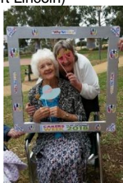
Port Augusta carers celebrated National Carers Week with a BBQ on the foreshore and some playground fun.