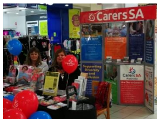
Mount Gambier: Pop up stand at a local shopping centre