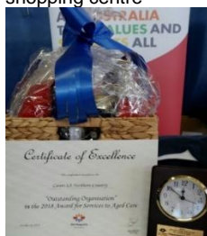
Port Augusta won the 'Outstanding Organisation 2018 Award'